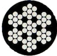
7 X 7