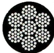
7 X 19